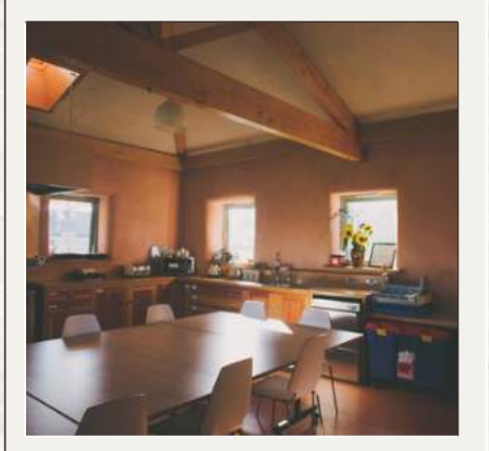
Straw bale Kitchen only