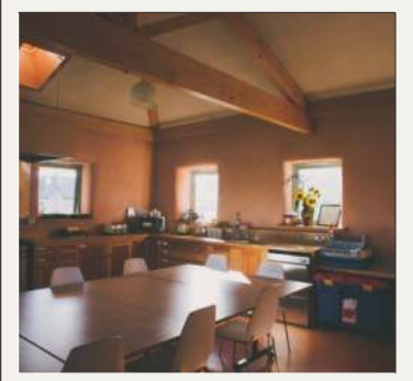
Straw bale Kitchen only

Our community package is aimed at local community organisations, groups, charities, schools or education providers. To qualify for this package you must provide relevant evidence of your association with the above.