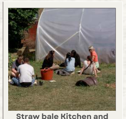
Community Garden (Entire site)

For 3 or more community block bookings receive 10% discount. For 6 or more community block bookings receive 20% discount. All must be booked within a 12 month period. We ask for a 50% deposit upfront for community and commercial bookings (not returnable if you cancel).